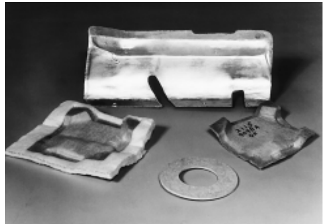
Press-formed parts made from Fiberfrax Duraset felt.

*For availability of nonstandard sizes, contact our Customer Service Department at 716-278-3800.